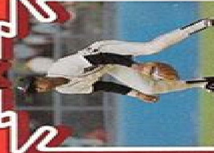
LOU WHITAKER Detroit Tigers Rookie of the Year

NEW YORK YANKEES BOSTON RED SOX MILWAUKEE BREWERS BALTIMORE ORIOLES DETROIT TIGERS CLEVELAND INDIANS TORONTO BLUE JAYS