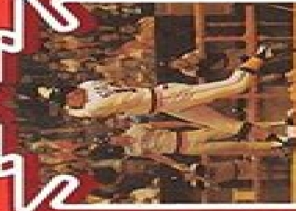
RUSTY STAUB Detroit Tigers Outstanding Designated Hitter

KANSAS CITY ROYALS CALIFORNIA ANGELS TEXAS RANGERS MINNESOTA TWINS CHICAGO WHITE SOX OAKLAND A'S SEATTLE MARINERS