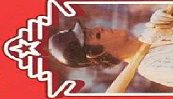
BUCKY DENT New York Yankees World Series MVP