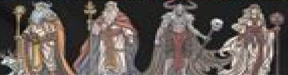
VOLOS STRIBOG ZORYA MOKOSH