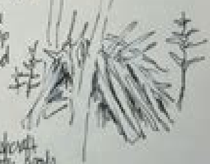
Backwards but in the middle