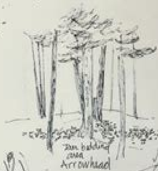
San holding area Arrowhead