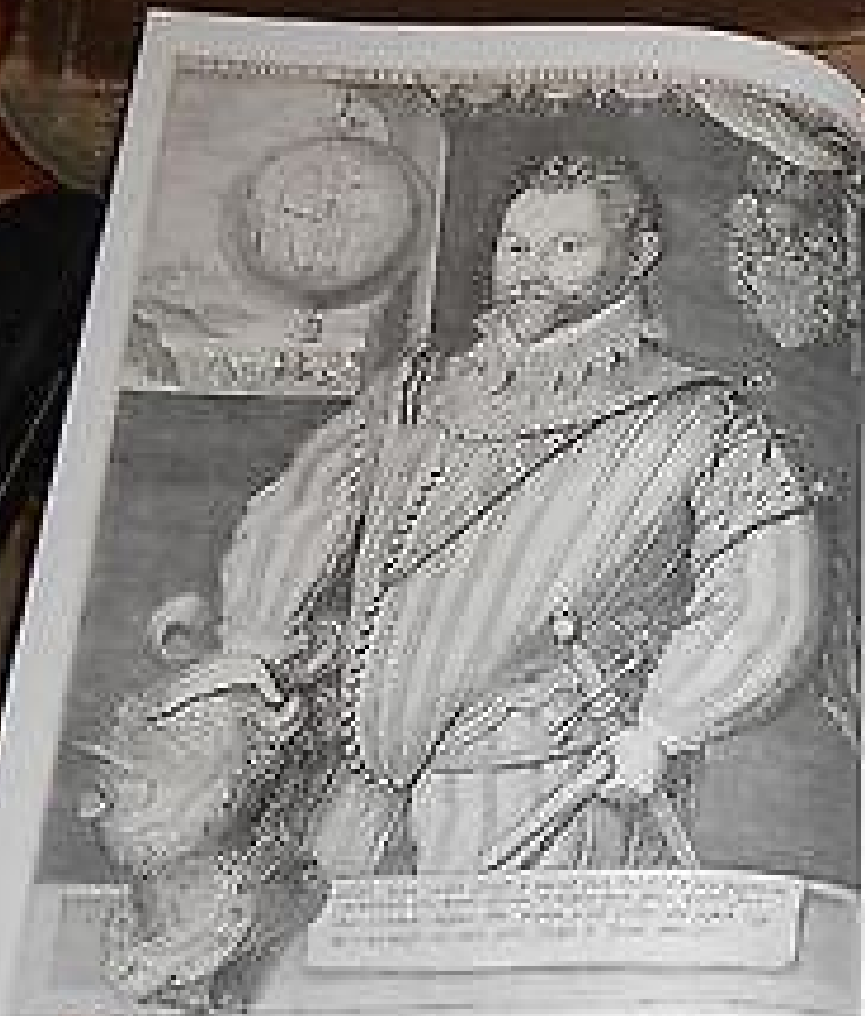
This portrait of Sir Francis Drake is based on a portrait by Hans Eworth, which was engraved in 1592. The portrait of Drake is based on a portrait by Hans Eworth, which was engraved in 1592. The portrait of Drake is based on a portrait by Hans Eworth, which was engraved in 1592.

WITH AN INTRODUCTION BY THE EDITOR OF THE NATIONAL ARCHIVES AND A SHORT HISTORY OF THE DRAKE COLLECTION