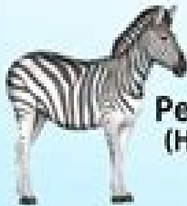
Perissodactyla (Horses, rhinos)