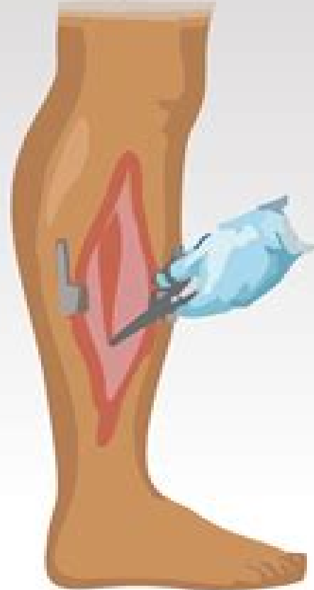
The Fascia is Incised