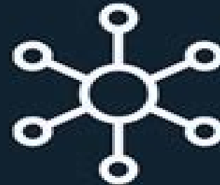
Direct Shipment vs. Hub-and-Spoke System