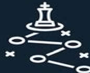
Push vs. Pull Strategy