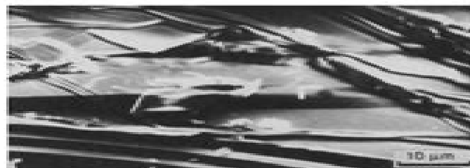
Figure 1 The BSCCO sample photographed by a scanning electron microscope (Cambridge Instruments, Stereoscan 250 MK2) with magnification \times 2000 . Chemical microanalysis by X-ray fluorescence indicated a \text{Bi}_4\text{Sr}_3\text{Ca}_2\text{Cu}_4\text{O}_x composition.

Single crystal samples of Bi-Sr-Ba-Cu-O compounds, used in this work were grown by the high temperature solution method with a start composition of \text{Bi}_4\text{Sr}_3\text{Ca}_2\text{Cu}_4\text{O}_x in platinum crucibles. Starting carbonates and oxides (99.99%) were mechanically mixed and slowly heated until 880^\circ\text{C} and kept at this temperature for 10 h for the complete chemical reaction. A slow cooling program was used to decrease the temperature from 880 to 800^\circ\text{C} at a rate from 0.4^\circ\text{C h}^{-1} up to 2.2^\circ\text{C h}^{-1} and finally furnace cooling until room temperature. This nonlinear temperature pro-