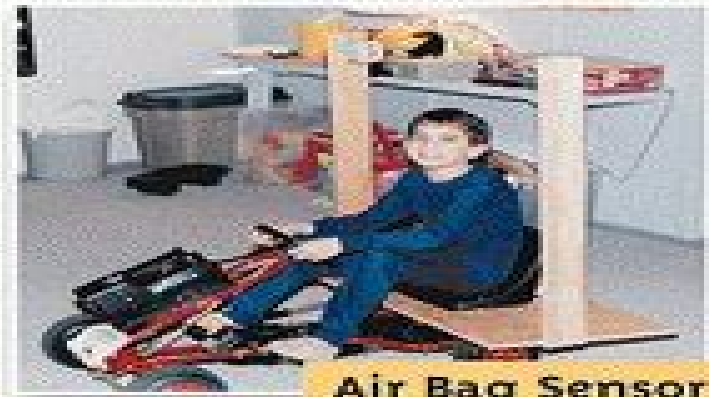
Air Bag Sensor