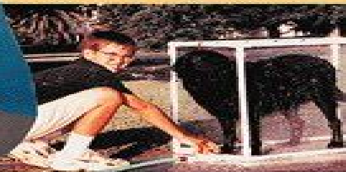
Automatic Dog Washer