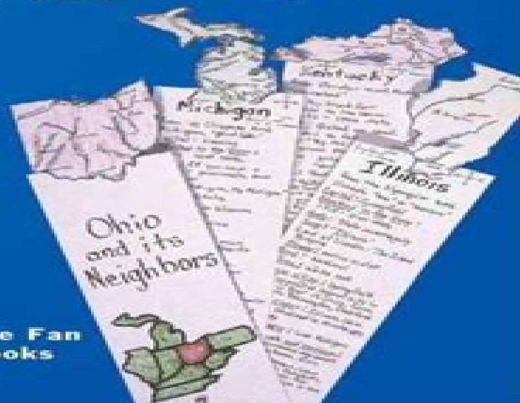
State Fan Books