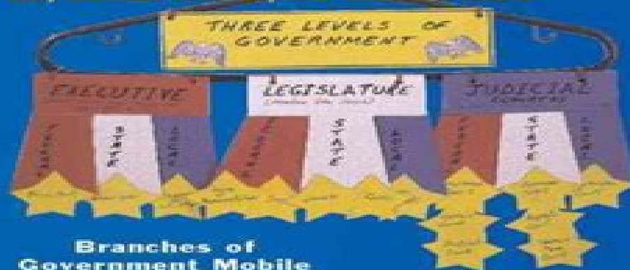
Branches of Government Mobile