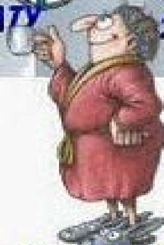
ALL DRIED UP