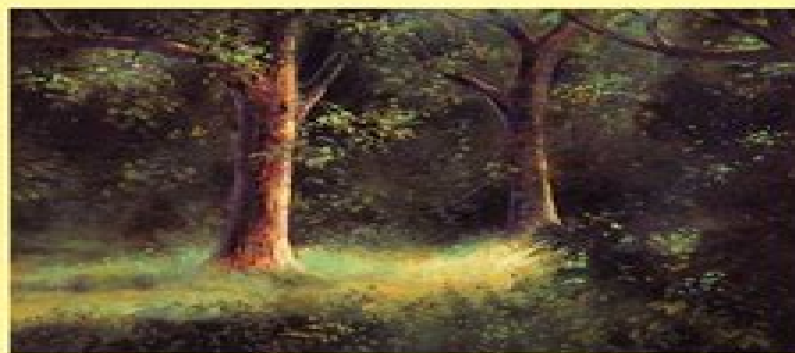
Wood Interior II by Buck Paulson