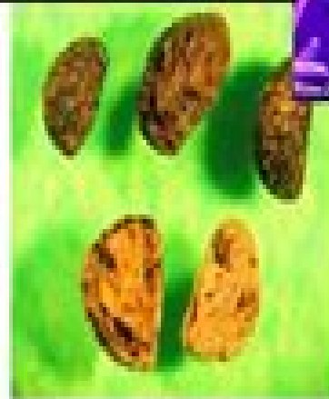
Raspberry Pin Cherry