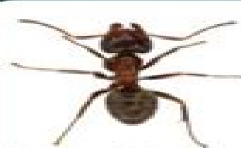
Velvety Tree Ant