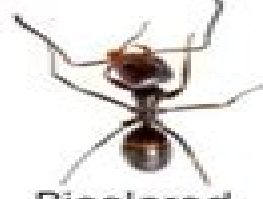
Bicolored Pyramid Ant