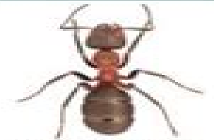
Formica Ant (Wood Ant)