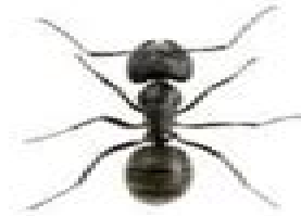
Little Black Ant