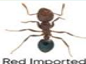
Red Imported Fire Ant