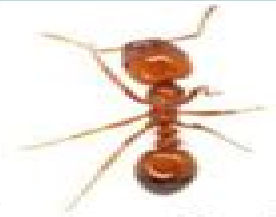
Southern Fire Ant