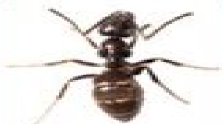
Odorous House Ant