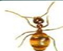
Small Honey Ant