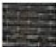
Basalt fiber-reinforced polymers (BFRP)