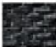
Carbon fiber-reinforced polymers (CFRP)