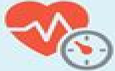
High Blood Pressure