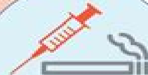
Smoking and/or Drug Use