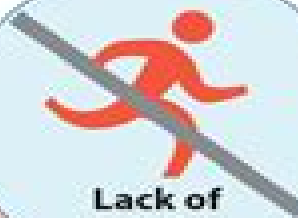
Lack of Exercise