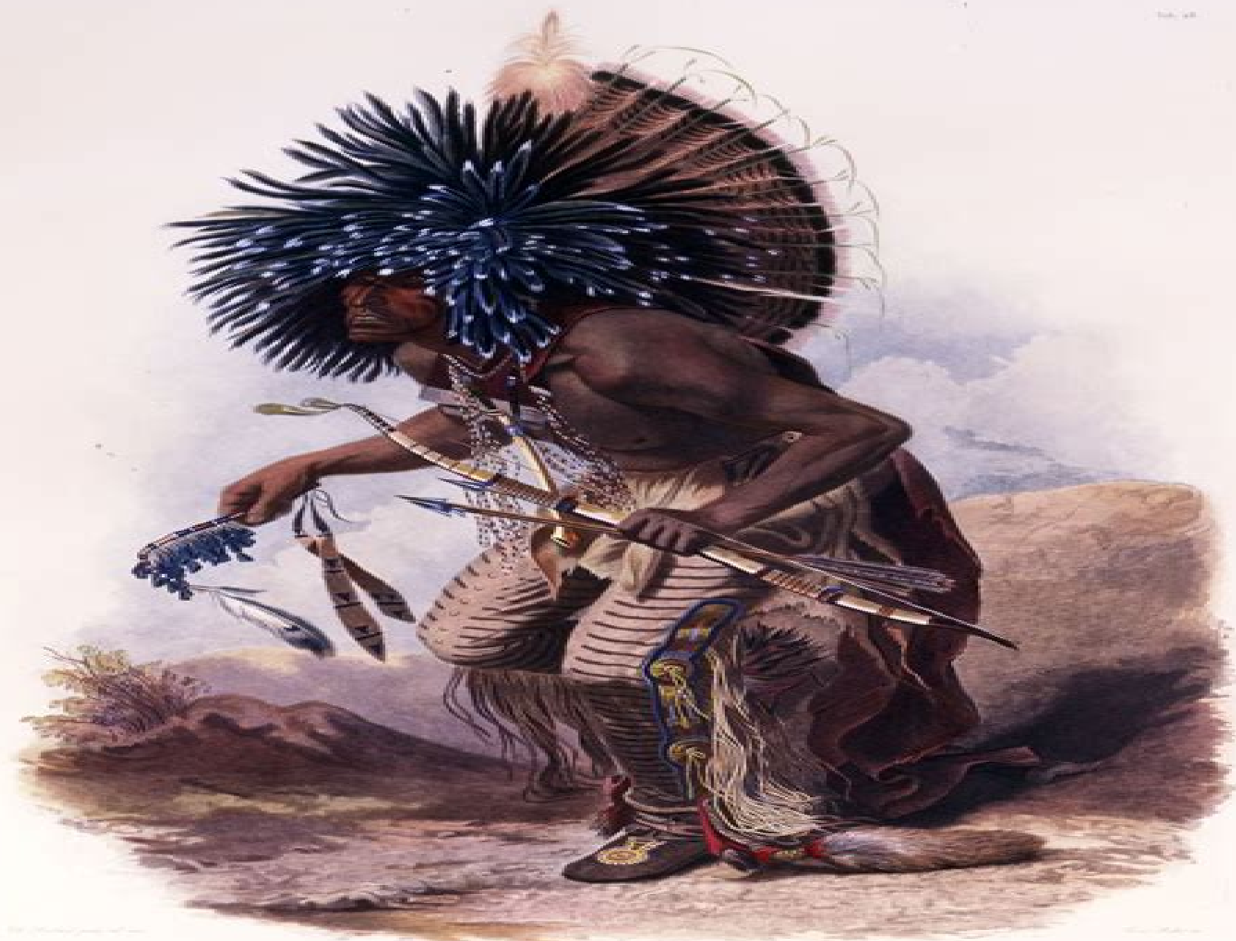
IPWIRITKA - RITRIPA