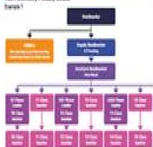
School Staffing Structure Examples - Primary