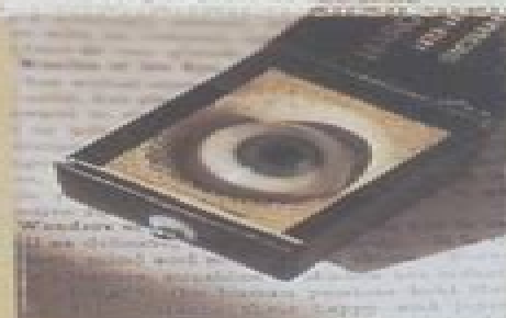
Wooden Case of the Eye