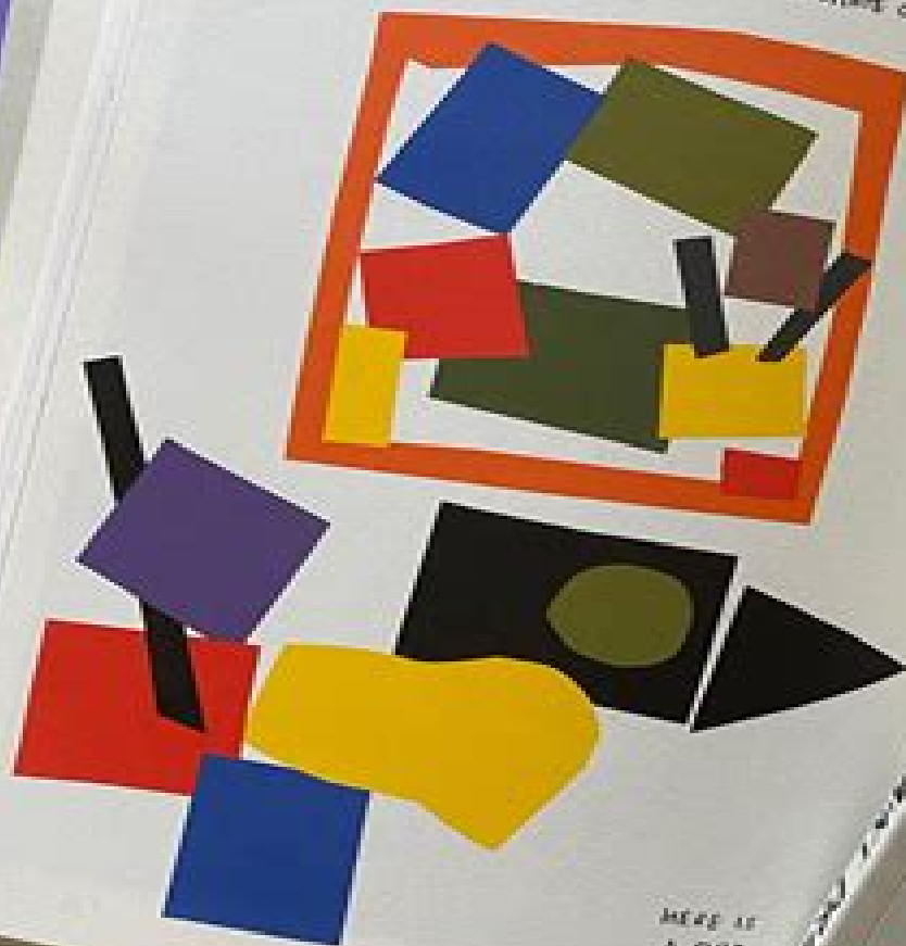
HERE IS A SNAIL