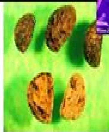
Raspberry Pin Cherry