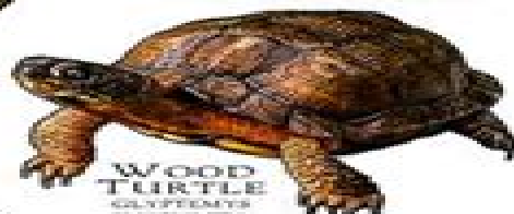
WOOD TURTLE GLYPTHEMYS INSULPURA