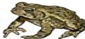
FOWLER'S TOAD ANAXYDRUS FOWLERI