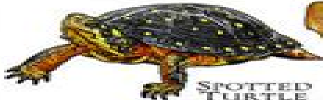
SPOTTED TURTLE CLEMmys GERTTATA