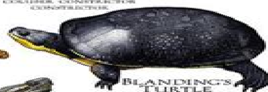
BLANDING'S TURTLE EMYDOIDEA BLANDINGII