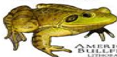
AMERICAN BULLFROG LITHOBATES CATERSIANUS