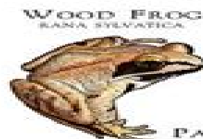
WOOD FROG RANA SYLVATICA