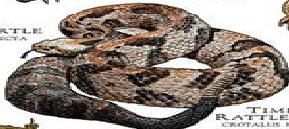
TIMBER RATTLESNAKE CROTALUS HORRIDUS