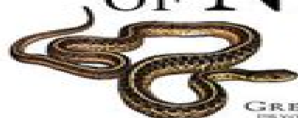
COMMON GARTER SNAKE THAMNOPHIS BISTALEIS