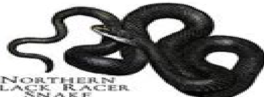
NORTHERN BLACK RACER SNAKE COLLIER, CONSTRUCTOR CONSTRUCTOR