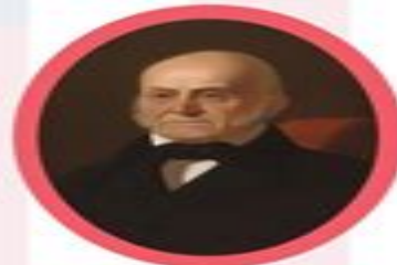
John Quincy Adams