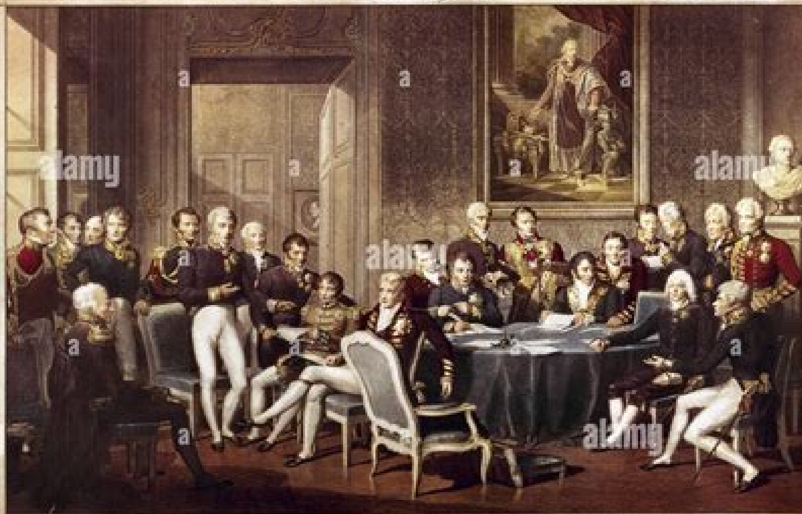
TREATY OF AMIENS 1802