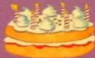
cake la torta