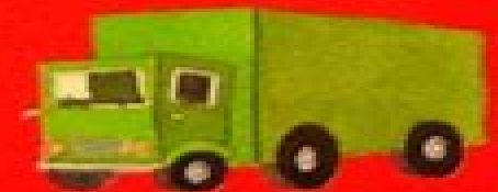
truck el camión