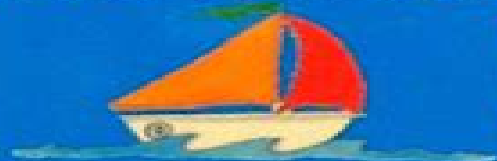
sailboat el velero