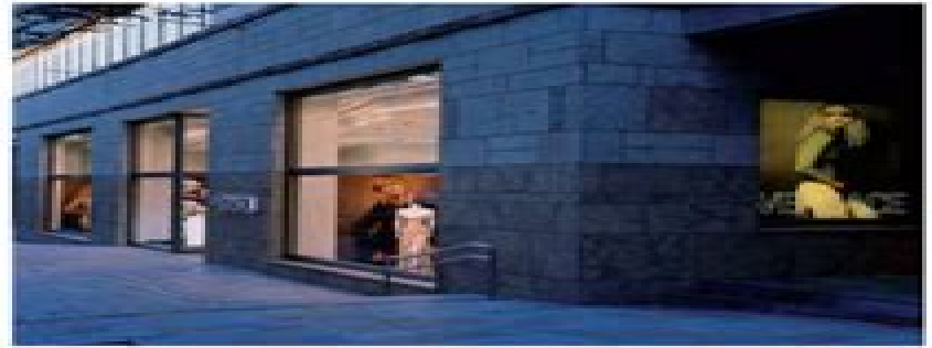
Gianni Versace Tokyo - Roppongi 2004