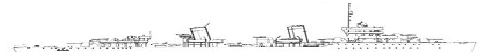
Leningrad class destroyer Baka, about 1945.