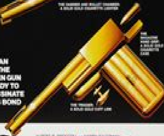
THE TRIGGER: A SOLID GOLD CUFF LINK

THE MAN WITH THE GOLDEN GUN IS READY TO ASSASSINATE JAMES BOND