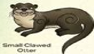
Small Clawed Otter