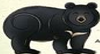
Asiatic Black Bear