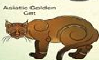
Asiatic Golden Cat