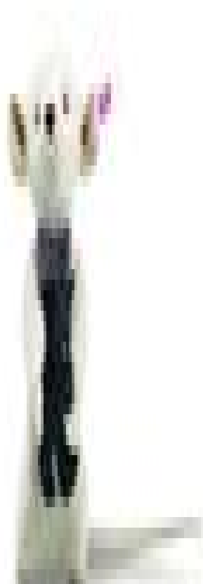
Peky Mouse With Teddy Bear