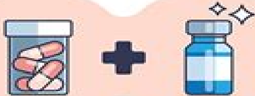
DRUG - DRUG INTERACTION