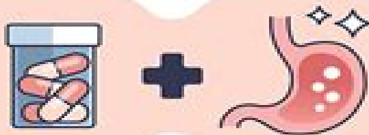
DRUG - ALLERGY INTERACTION