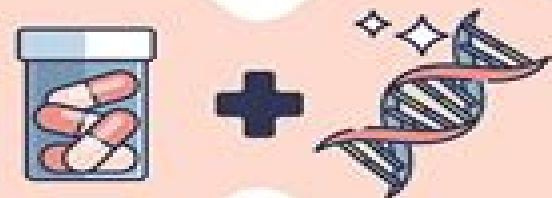
DRUG - GENE INTERACTION