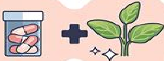
DRUG - HERB INTERACTION