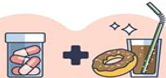
DRUG - FOOD INTERACTION