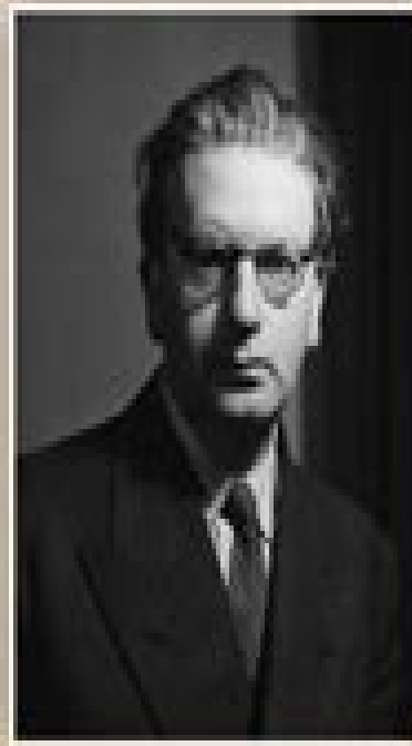
John Logie Baird