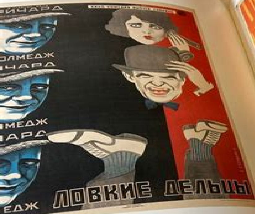
8.2 x 72 cm) Collection, Tokyo William K. Howard. Original title: Danger Ahead. A man reported dead; having lost his memory, he is hunted to his wife.