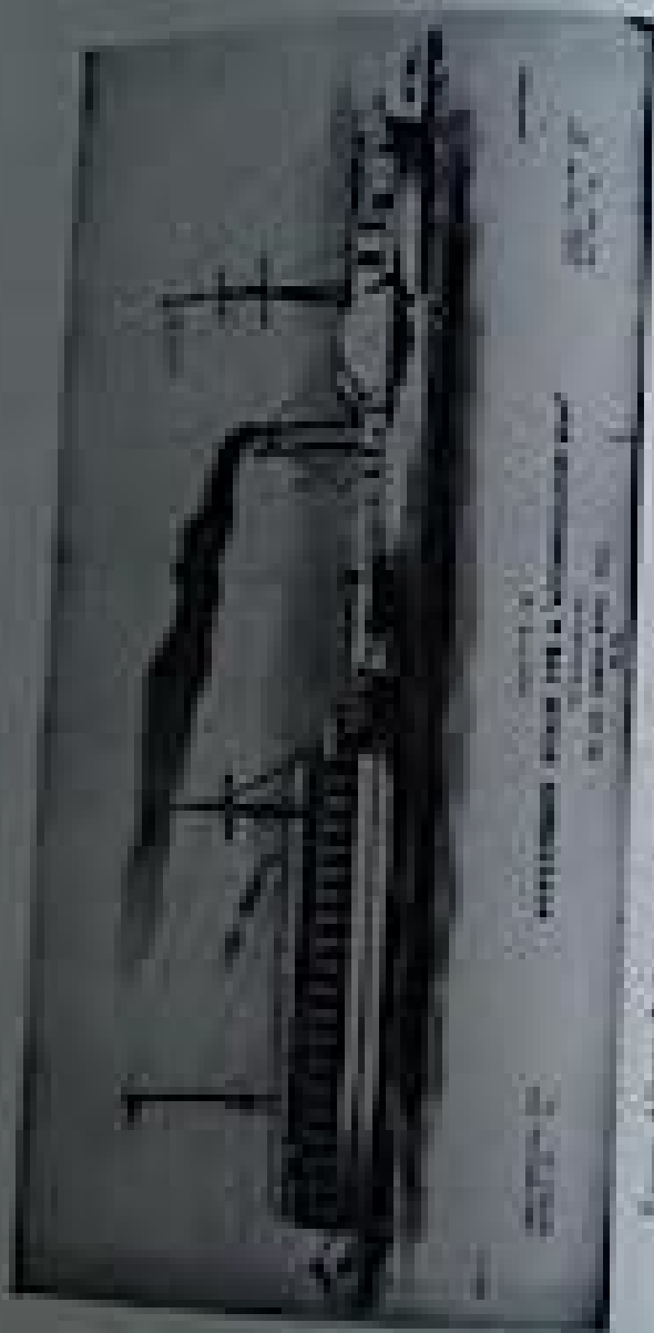
From Great Britain , August 1857. A view of the river, showing the steamship, and the bridge, from the river bank, Calcutta, 1857.