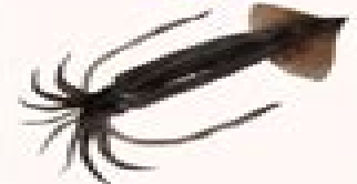
Japanese Flying Squid