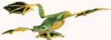
Wallace's Flying Frog