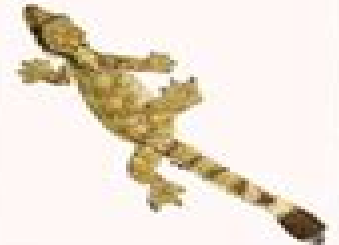
Kuhl's Parachute Gecko