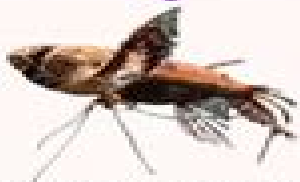
Freshwater Butterfly Fish