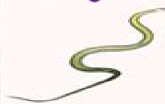
Paradise Tree Snake