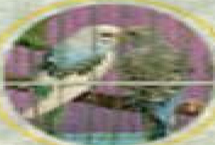
BLUE AND WHITE