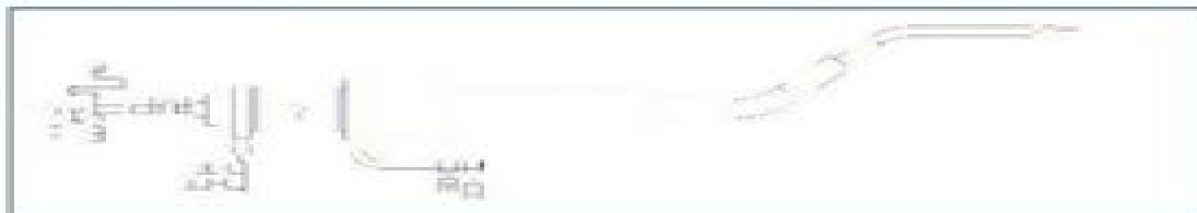
Figure 3: MultiMatch layout.