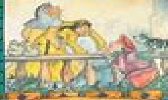
Romeo and Juliet