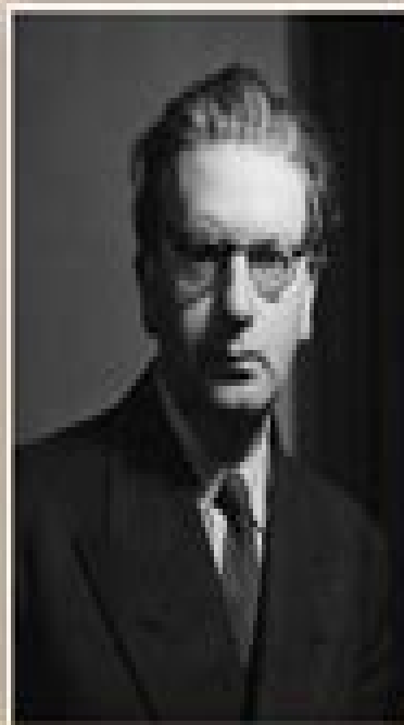
John Logie Baird