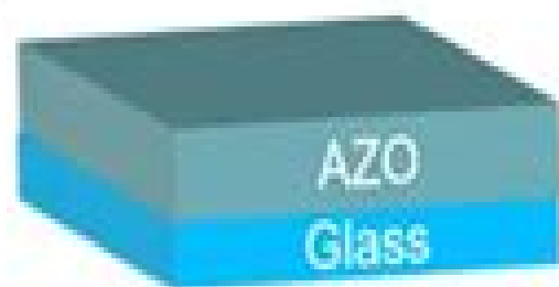
Deposition of AZO