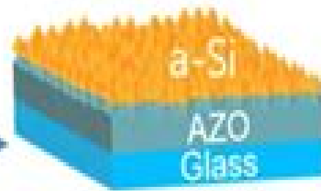
Deposition of sacrificial layer