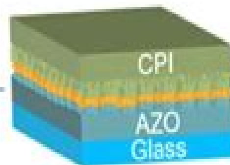
Coating of CPI