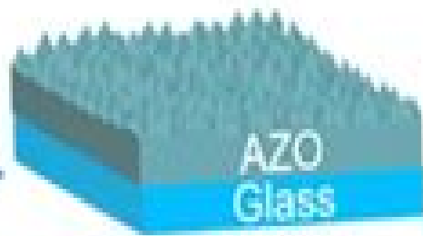
Etching with acid solution