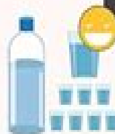
Drink enough water