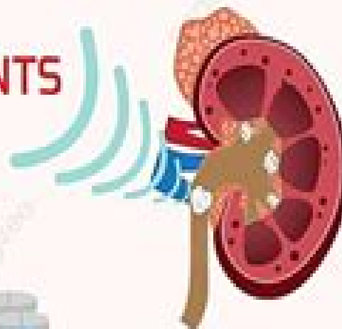
Ultrasound shock waves

Lorem ipsum dolor sit amet, consectetur adipiscing elit, sed do eiusmod tempor incididunt ut labore et dolore magna aliqua.