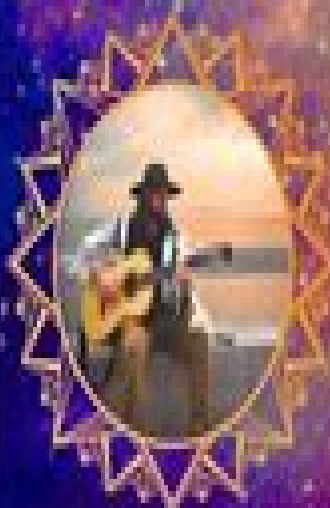
CALEB AUSTON | KANAPE

A DAY OF CACAO, KIRTAN AND ECSTATIC DANCE