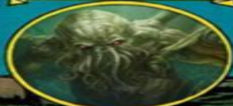
Call of Cthulhu