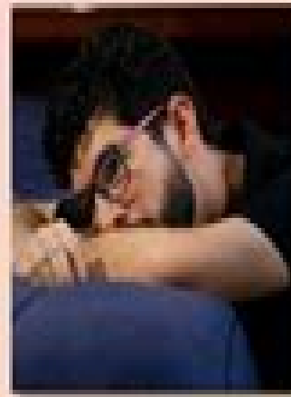
SOCIAL ANXIETY DISORDER