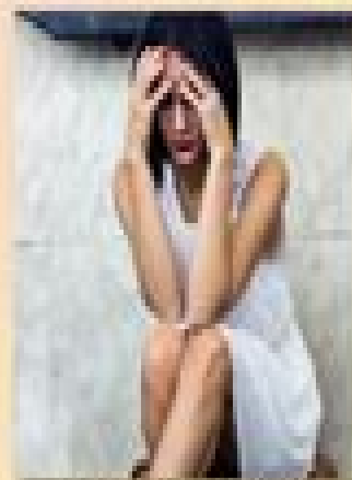
SEPARATION ANXIETY DISORDER