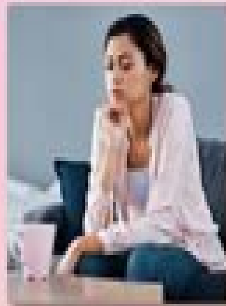
OBSESSIVE COMPULSIVE DISORDER