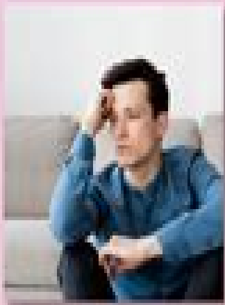
GENERALIZED ANXIETY DISORDER