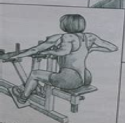
IMITATION WITH SPECIFIC MACHINE REPRODUCING T-BAR MOVEMENT

Stand on the platforms provided on each side of the T-bar. Keep your knees slightly bent and your back straight. Bend over at about a 45-degree angle or rest against the incline bench if one is provided: - Inhale and pull the T-bar up until the plates contact your chest - Exhale as you complete the movement This exercise