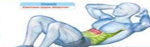
Crunch Exercises Upper Abdominal

Important Note: Position Supported by Forearms and Feet - Supporting Naturally Contracted Abs Pressing On Mat/Support Floor - Hold the Substack Toes. • Side Plank Hip Dip: During Side Plank Lower and Raise Hip To Floor. Intermediate Exercise.