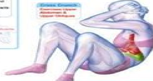
Crunch Exercises Upper Abdominal & Lower Obliques

Collective name for muscles that fix and stabilize the torso and spine. Includes Transverse Abdominis and Internal Obliques, Rectus Abdominis and External Obliques.