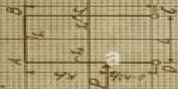
INFLUENCE LINES FOR MOMENTS AND REACTIONS DUE TO HORIZONTAL LOADING.