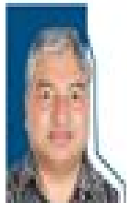
DR DISHNU RAJ UPRETI (SPEAKER) Executive Chairperson of Policy Research Institute, Nepal

1700 - 1830 IST | 1630 - 1800 PST | 1715 - 1845 NPT | 1730 - 1900 BST