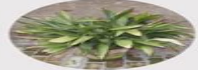
Cast Iron Plant