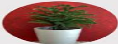
Norfolk Island Pine