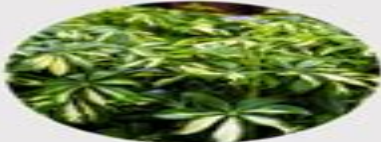
Australia Umbrella Tree