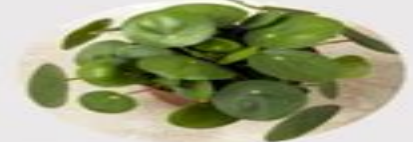
Chinese Money Plant