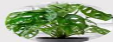
Swiss Cheese Plant