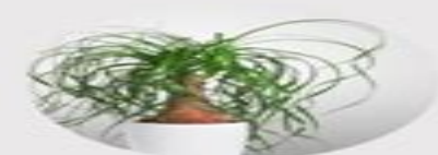
Ponytail Palm Plant