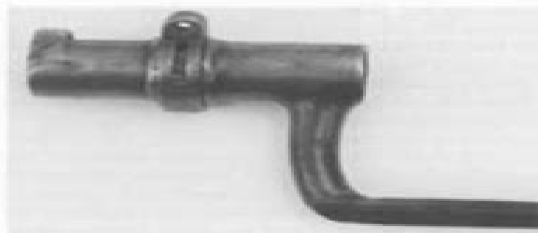
Figure 1-13. United States Model 1851 Cadet

Companion Arm: US Model 1851 Cadet Musket